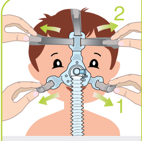
Adjust the headgear settings, starting at the bottom and working upwards. Be careful not to make the headgear too tight. The cushion should not cover the mouth.